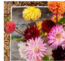
clockwise from top left The 100-year-old dahlia garden. An inn room featuring cozy chestnut paneling and a king bed. A lakeside cottage room with a private porch. Early morning mist rises above the 35-acre Hampton Lake. A bouquet of the famous dahlias.