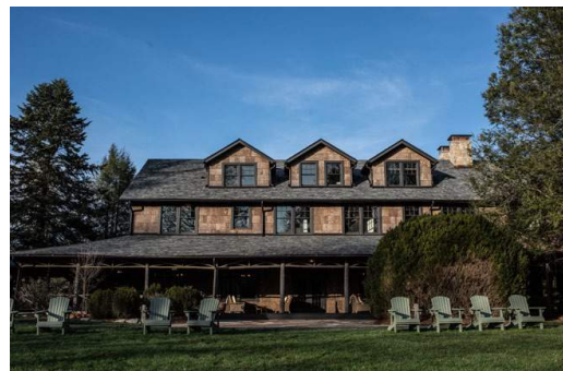
top to bottom High Hampton's signature view of Rock Mountain. The classic bark-sided inn maintains its historic charm.

ROCK MOUNTAIN BY ANN YUNGMEYER. ALL OTHER PHOTOS COURTESY OF HIGH HAMPTON